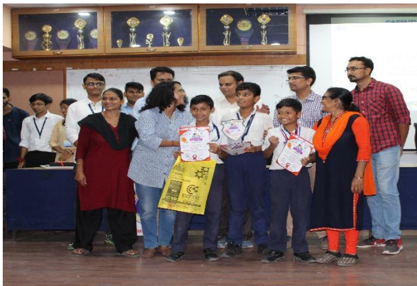
JET TOY WINNER- SHETH C N SCHOOL