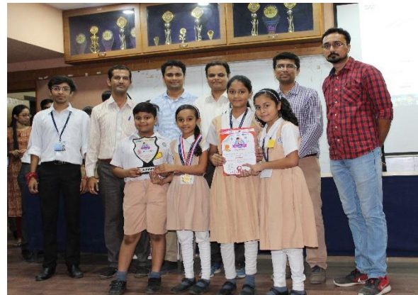
SKIMMER WINNER- D.C. SHAH PRIMARY SCHOOL