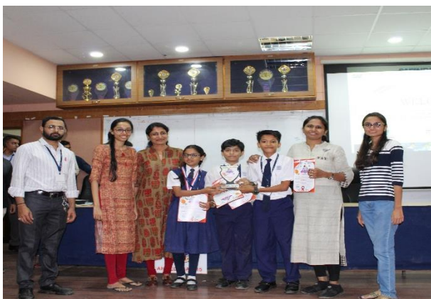
JET TOY RUNNERS UP - BEST SCHOOL