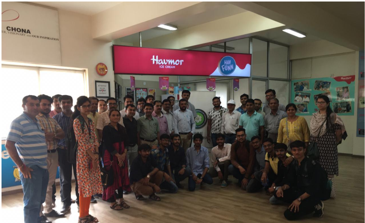
HAVMOR ICECREAM INDUSTRIAL VISIT at GIDC-NARODA