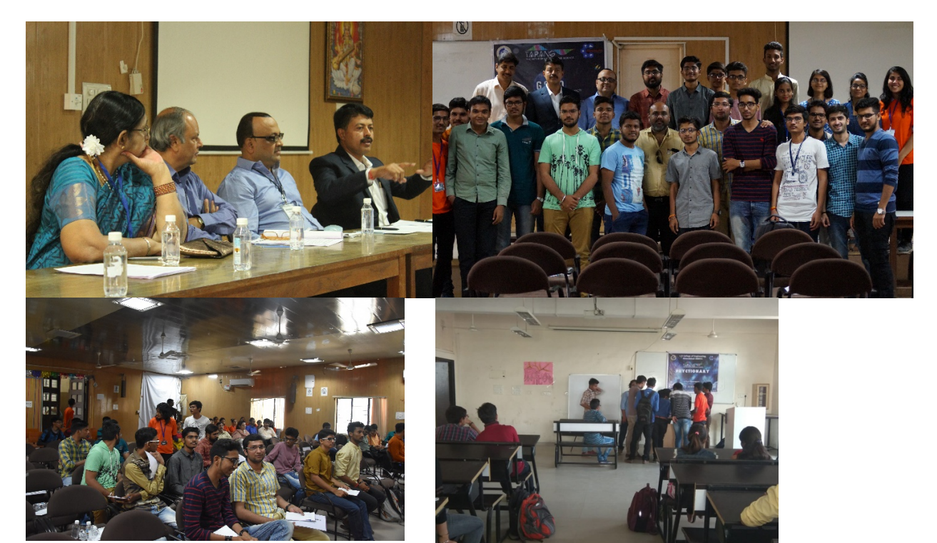
Global Space Summit (GSSO)