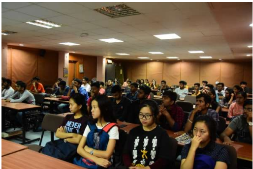
Workshop on Career Guidance