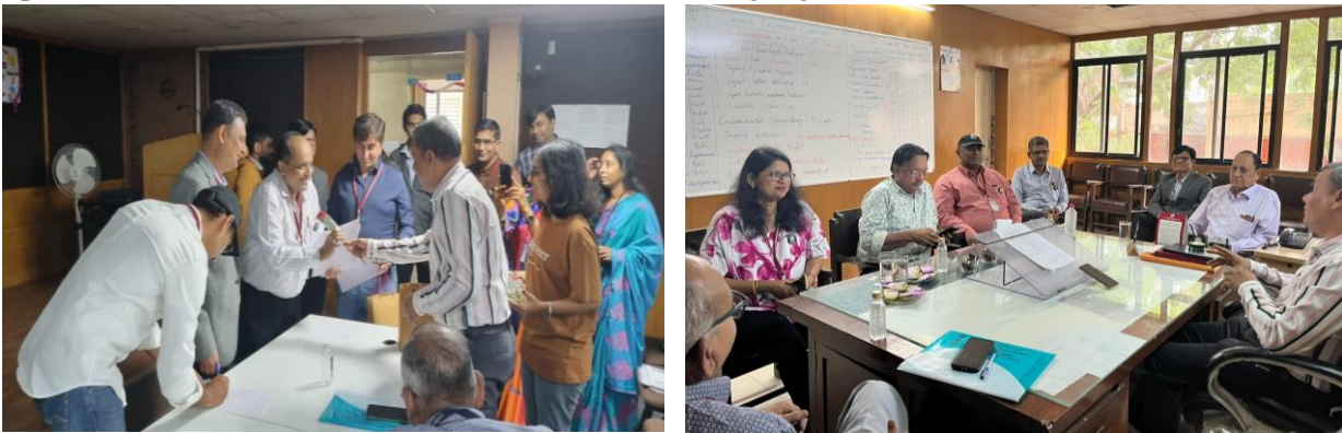
Fig 1.2: Alumni interaction with department faculties and students

The visit was followed by a department presentation where the path taken by the department over the years was showcased along with the faculty and student achievements. Moreover, information related to current improvements needed in terms of infrastructure was also highlighted.