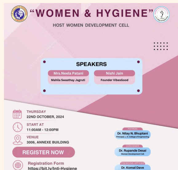
Intimate Hygiene for female