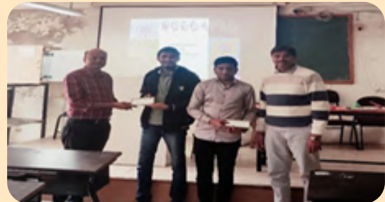
Mathematics Day Celebration Quiz winner 2024