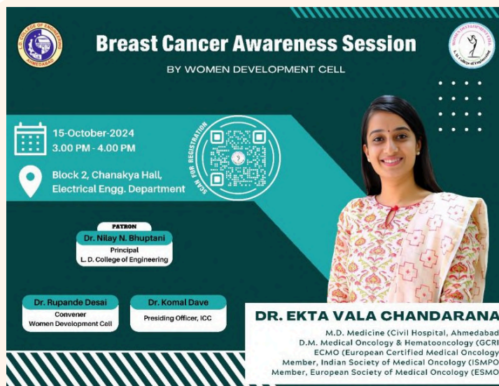
Breast Cancer Awareness