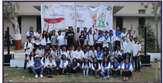
Pinkathon on 3rd March 2020: