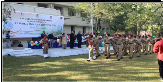
Rangamazi on 26th February 2020: