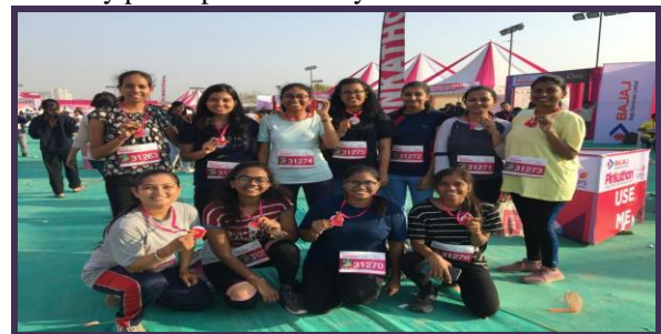
Guard of Honor during 9 th Annual GTU Convocation by NCC Cadets