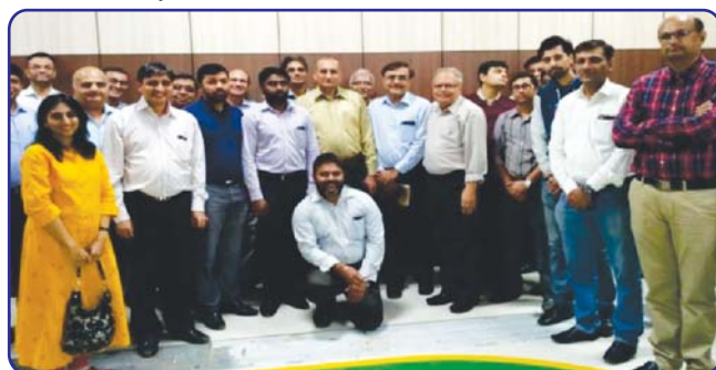
AMA VISITORS VISITING COE-Siemens Centre