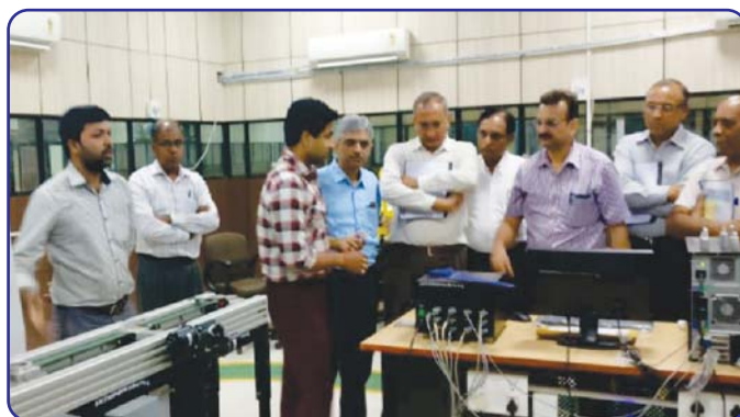
ITAMMA VISITORS VISITING COE-Siemens centre